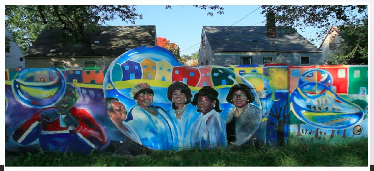
Detroit's Eight Mile Wall now features uplifting imagery of children blowing bubbles, colorful houses, and inspirational figures.