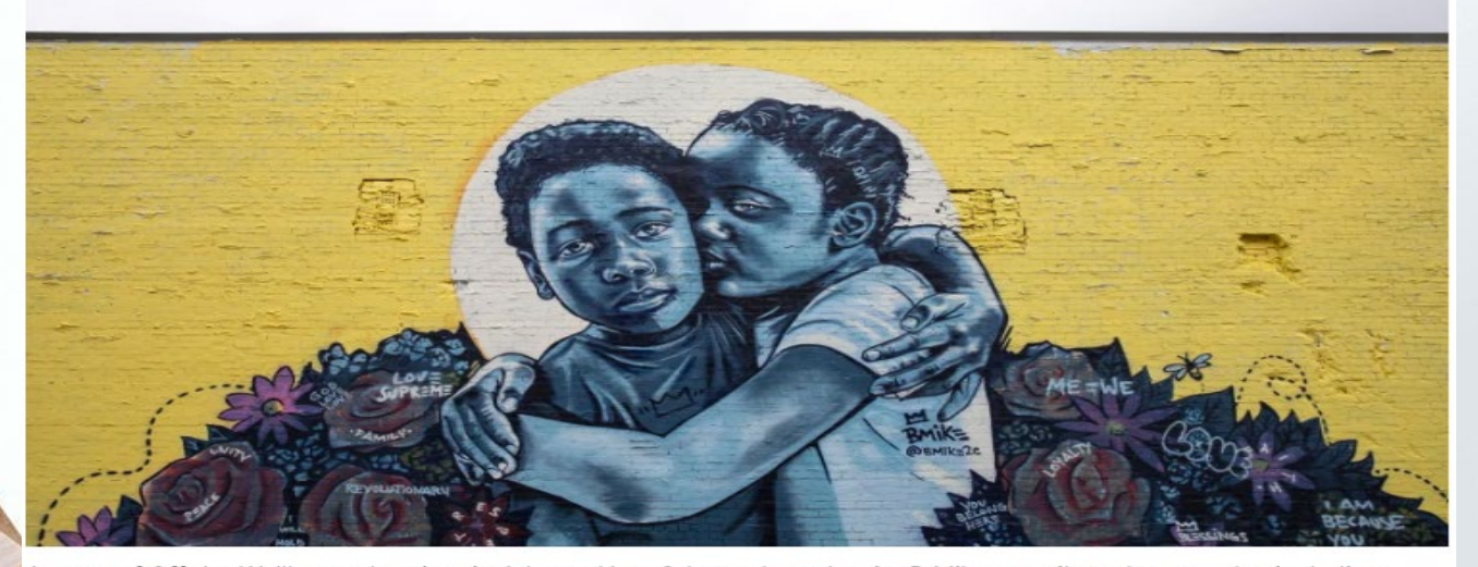
As part of Off the Wall's mural project in Atlanta, New Orleans-based artist B Mike contributed two works, including "Love & Protection" responding to issues facing the next generation.