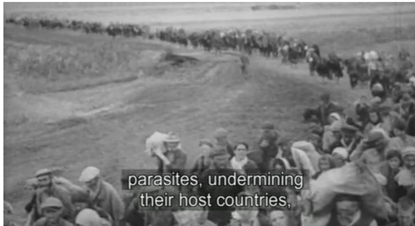
Figure 5: Screenshot from BBC’s Auschwitz: The Nazis and the Final Solution