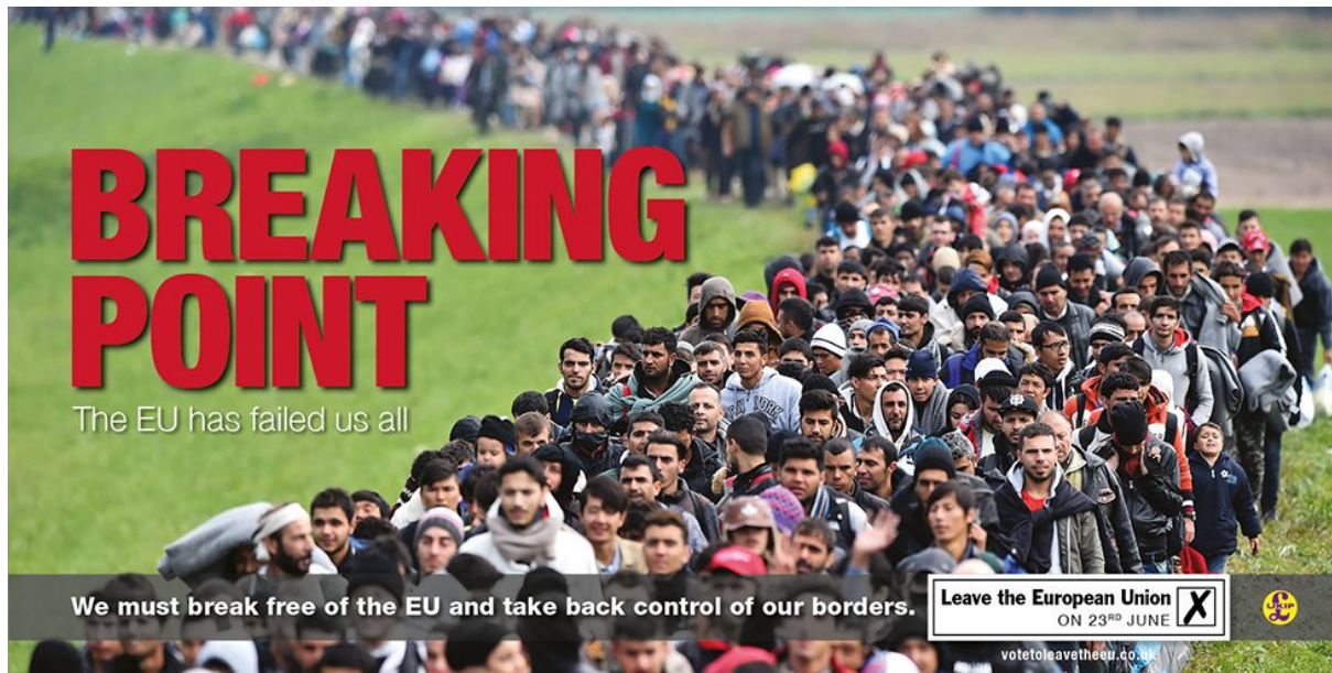
Figure 3: Breaking Point billboard