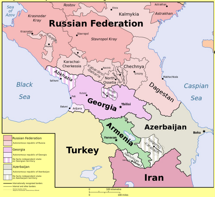
Geopolitical map of the Caucasus Region (2008)

Since the breakdown of the Soviet Union, the region has been plagued by territorial disputes between these three states of the South Caucasus as well as that of the Russian Federation. Since 1988, the region has played host to no fewer that six full-scale wars over these various territorial issues. Georgia is primarily Eastern Orthodox by faith. Azerbaijan is primarily Shia Muslim, with the breakaway Republic of Nagorno-Karabakh adhering more closely to the Armenian Apostolic Church, which is also the dominant faith of Armenia.